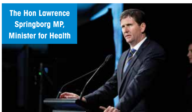
The Hon Lawrence Springborg MP, Minister for Health