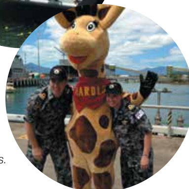
Healthy Harold with sailors at HMAS Cairns.