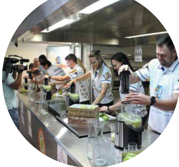
Ocsober launch at Brisbane Markets

The event was covered by Channel 7 and Brisbane community television station 31 Digital.